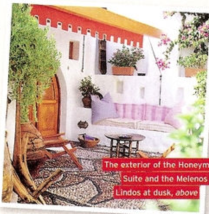
The exterior of the Honey Moon

The hotel will take you deep into the heart of the Mediterranean, in the most dreamy Greek gods' lifestyle. Hope to see you soon! From $500 to $1,200; 30-224/403-2222